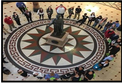
ICEARY Student Ambassadors in Springfield.