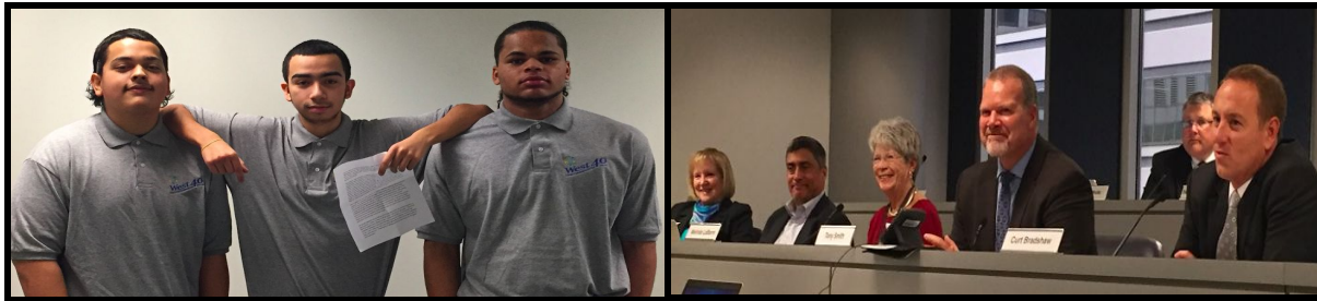
ICEARY Student Ambassadors testify to members of the Illinois State Board of Education in Chicago.

The Illinois Coalition for Educating At-Risk Youth (ICEARY) will host a Student Ambassador Academy on Thursday, February 22, 2018 at the Northern Illinois University, DeKalb, Illinois from 9:30 a.m. to 1:30 p.m.